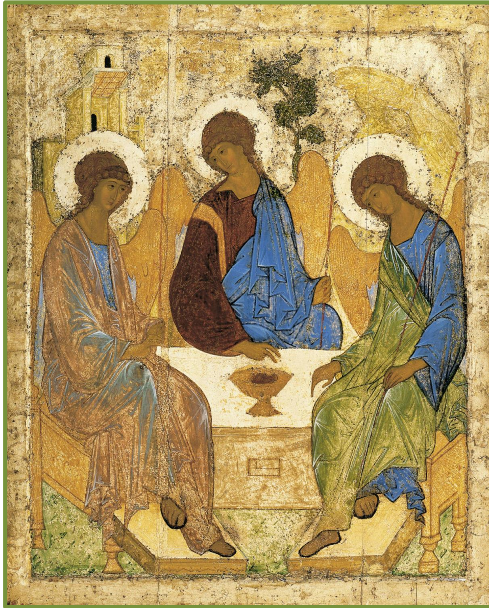
Trinity by Andrei Rublev (15 th century)