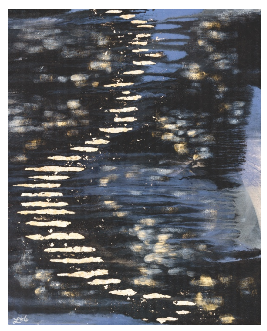
Again & Again: We Are Shown the Way "Overturn"